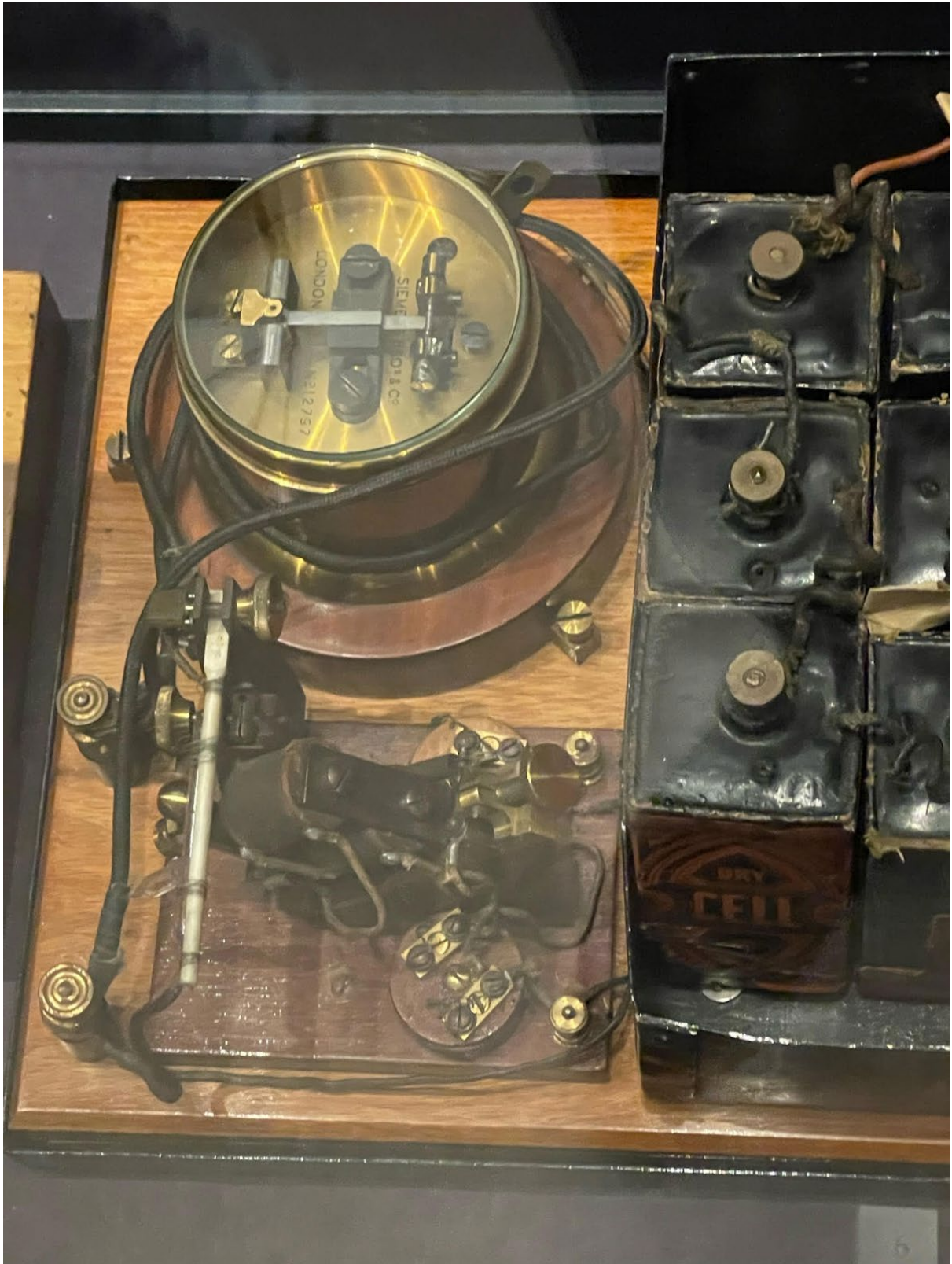
COHERER RECEIVER 1896